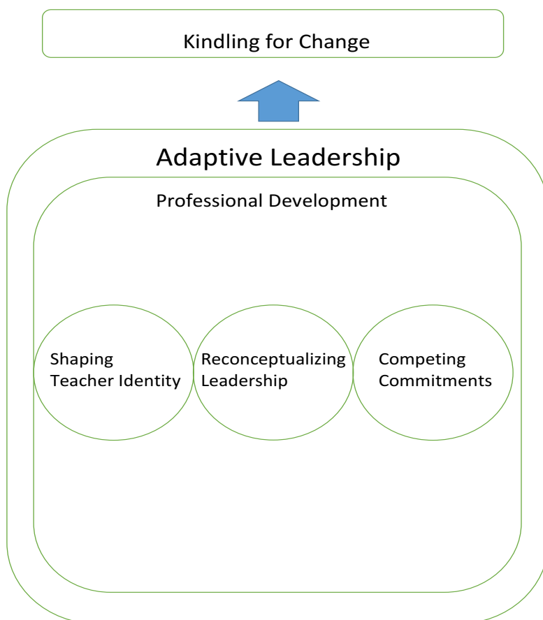
Figure 1. Three categories merging into a core theme. Three categories that emerged from the data in the professional development program, organized by the researcher as an adaptive leader merge into the core theme of kindling for change.

Competing commitments, shaping teacher identity, and reconceptualizing leadership mentioned above are the areas that offer salient contextual considerations to inform those who want to promote adaptive leadership into a teacher development program created for JTEs who experience educational reform changes.